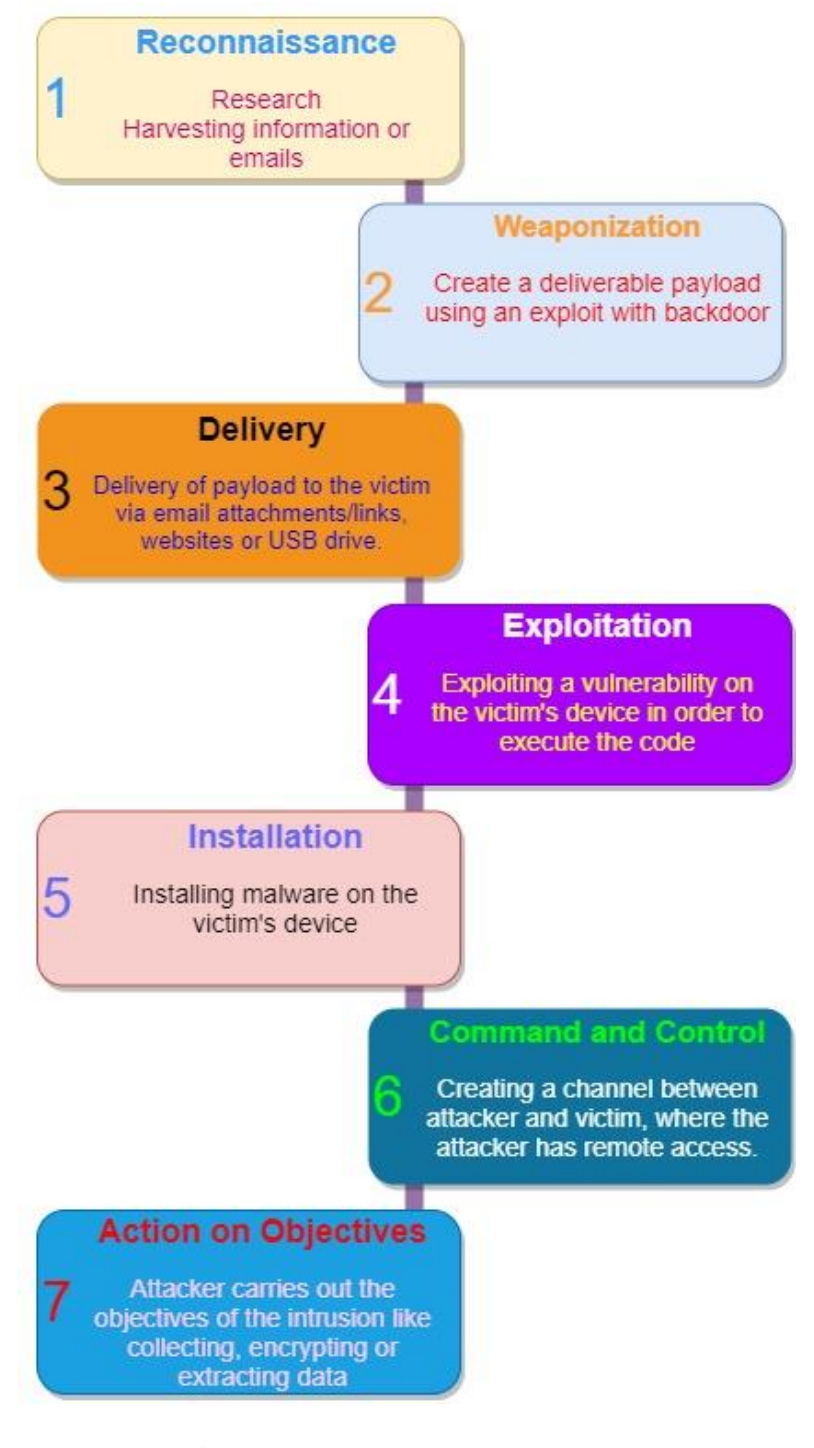
Fig. 2. Lockheed Martin Kill Chain

In this case, both Pegasus and Chrysaor can be broken down in these seven stages/phases. These were the steps taken by the attacker, in this case NSO Group in Israel to attack various countries making this cyber-attack one of the most sophisticated attacks of all time(Fig 2).