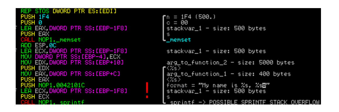
Figure 5, Immunity Debugger and more effective vulnerability research

Immunity Debugger and IDA Pro cut exploit development time as well as improve the effectiveness of vulnerability research. The example below (straight from Immunity's web site) shows how useful for security professionals can ImmDBG be.